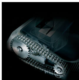
CHAIN heavy duty chain drive system and metal gears