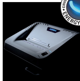
ENERGY SMART® management system with illuminated indicators for power saving in stand-by mode