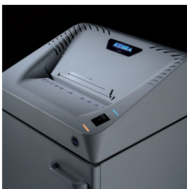
LED INDICATORS Easy to operate ON OFF Reverse switch, with LED signal for bag full or open door

SUPER POTENTIAL POWER UNIT heavy duty chain drive system with metal gears CONTINUOUS DUTY 24 hours continuous duty operation without overheating and duty cycles CUTTING KNIVES carbon hardened steel cutting knives unaffected by staples and clips ENERGY SMART® power saving stand-by mode just after 8 seconds of non-operation START & STOP automatic start and stop through electronic eyes with stand-by function SAFETY STOP automatic stop with light signal for bag full and / or open door AUTOMATIC REVERSE system in case of jamming CABINET attractive 135 litre cabinet mounted on casters