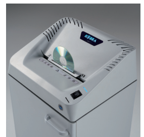
AUTO START & CD SHREDDING Automatic Start/Stop through electronic eyes. Integrated flap for CDs, DVDs, Floppy Disks and Credit Cards shredding